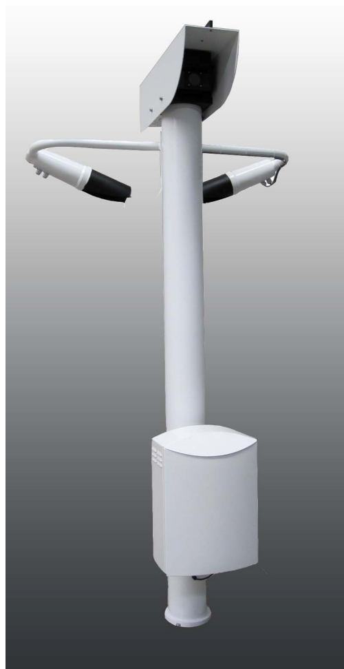
5000-200-EMOR Transmissometer source with high specification co-located visibility sensor as standard.

For up to CAT-IIIb operations Transmissometers are mounted in groups of 1, 2, 3 or 4 along the runway. Cat-III operations require accuracy down to very high values of extinction coefficient, The 24 bit analog to digital conversion extends dynamic range to eliminate this as a source of error, while the dynamic autocalibration system using the co-located forward scatter meter ensures reduced maintenance interval and high accuracy in the upper part of the range. Using a 30 metre baseline gives optimal performance at the low end of the range.