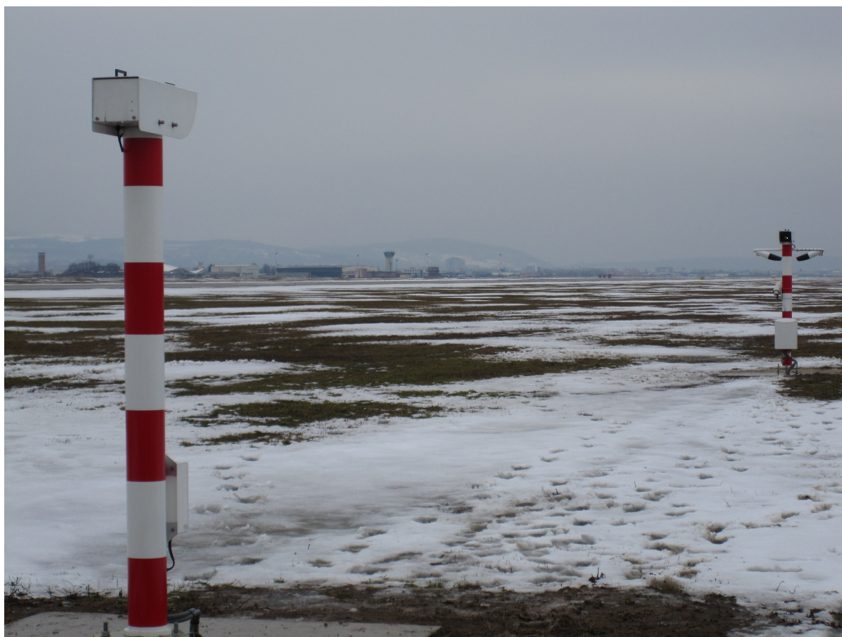
View of the 5000-200-EMOR Extended MOR Transmissometer installed in Eastern Europe where temperatures have reached -15C and below.